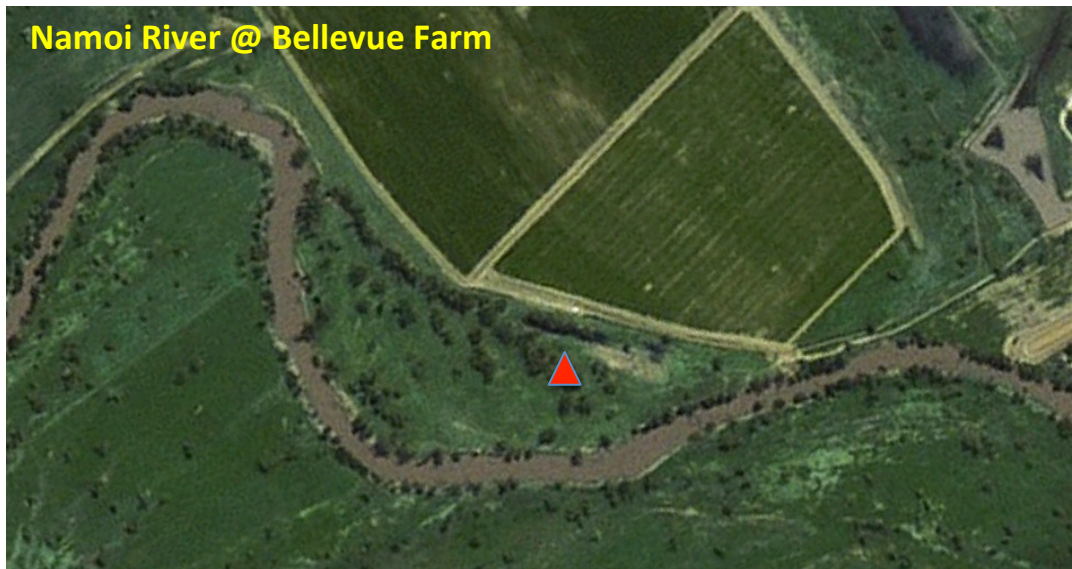
Namoi River @ Bellevue Farm